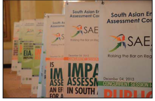
Panelists at SAEAC 13